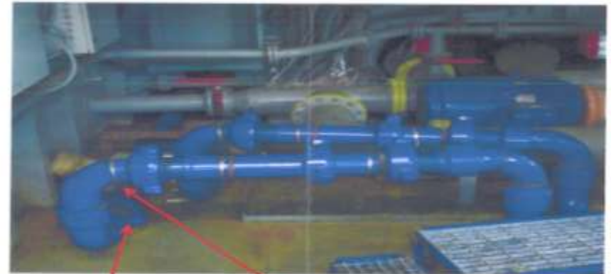
Wing which was disconnected